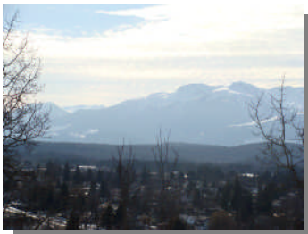
A view from Sparks Street and Munthe Avenue, in Terrace

Right now on the website we have pictures showcasing views near and around Terrace. Over the course of the project, we hope to change the pictures with the seasons. I look forward to seeing beauty from all over the Northwest region. Spring in Prince Rupert? Summer in Kitimat? Fall in Smithers? I can hardly wait!